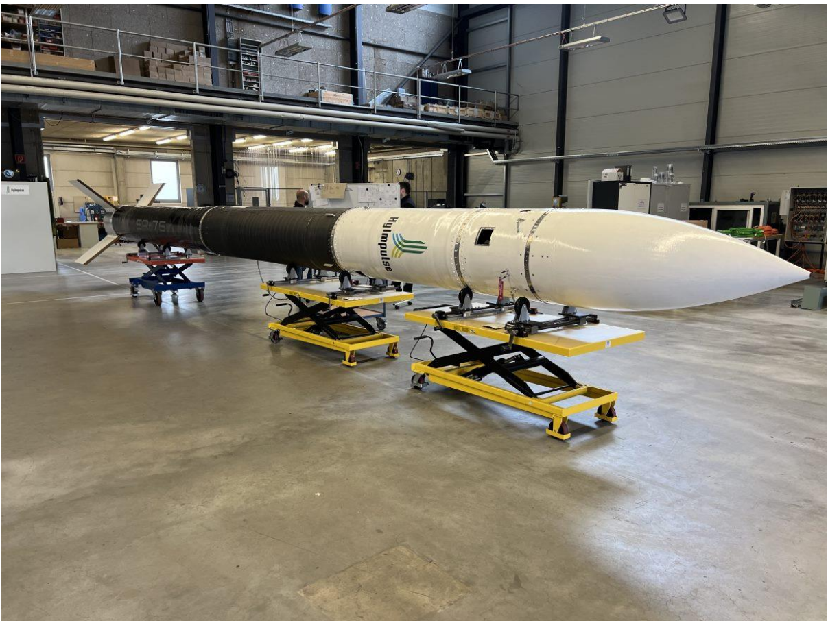
Figure 2: Suborbital sounding rocket SR75 first flight hardware